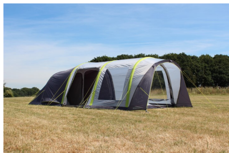
CRUIZ 6.0 TXL Outer Height: 215CM Inner Height: 200CM